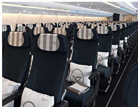
A330neo Premium Economy Class