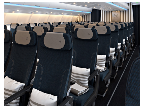
A330neo Economy Class