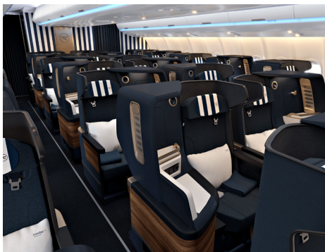
A330neo Business Class